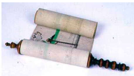
Fig. 3. Phendler’s map on a wooden roller