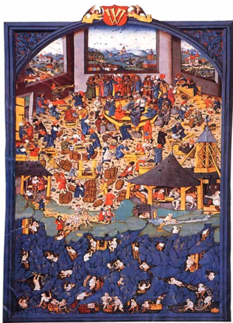
Fig. 2. Introductory page of the Kutnohorský mass songbook

One of the first works of Czech and European mining cartography is Rudolf’s Adit in Prague. As a mine surveyor Jiří Oeder from Ústí was invited to set-out the direction of this adit, accompanied by five vertical shafts, in the spring of 1582. In 1593 Isaac Phendler began to draw a map of the Rudolf’s Adit, (see Fig. 7) and recorded the course of the work during the tunnelling process week after week. Then there are marked places where the miners met during the tunnelling, with exact times. Thanks to this plan we know exactly how much rock was extracted per month. The map is drawn very carefully on a piece of parchment 198 mm wide, and approximately 2420 mm long. The drawing itself covers 2133 mm. As can be seen in Figure 3 a wooden roller is attached to the left edge to wind the map up. In 1648 Phendler’s map was stolen by Swedish troops during the Thirty Years’ War at the behest of Queen Kristina I. It is now displayed in the National Technical Museum. Queen Kristina I. probably took this map to Rome, and from there the map got to Paris, where at the end of the 19th century it was discovered in a shop of antiquaries by Dr Schebek, who bought it for the collection of the famous entrepreneur Vojtěch Lanna. During an auction the imperial counselor František Borovský bought this map and gave it to the Technical Museum of the Bohemian Kingdom, today’s National Technical Museum. There it has been stored since 1910, under number 1848.