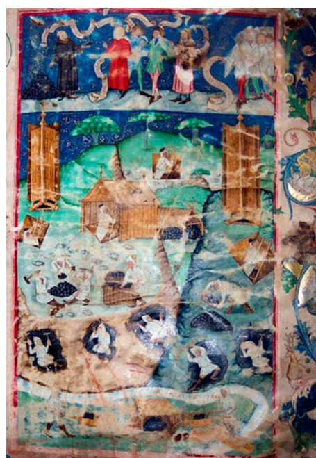
Fig. 1. Introductory page of the Kutnohorský antifonář with a picture of mining in Kutná Hora

The first information on mine cartographic works in our countries, belong to the end of the 15th century. Evidence of it can be found in the Kutnohorský antifonář from 1471 (see Fig. 1) and mainly on the title page of the Kutnohorský hymn book (mass songbook) from 1490 (see Fig. 2), where in the lower part of this