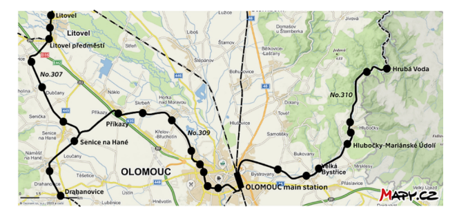
Figure 1. Map of the Olomouc regional railway network with the discussed lines and its stops marked bold

The city is also an important railway node with the main station being the 3rd busiest railway station in the Czechia. In total there are 5 railway lines with different parameters: line No 270 is the only double-track line as it is part of the Trans-European Transport Network(TEN-T), it has a single-track electrified branch heading south to Prostějov and Brno, line No 290 is a regional line with growing potential after recent modernization and electrification according to railway standards. The 2 remaining single-track non-electrified regional railway lines require a systematic solution for the upcoming modernization of the regional network, and they will therefore be discussed further - the radial line No 310 and most importantly the city-crossing line No 309 complemented by the part of line No 307 that connects the town of Litovel to the network. The railway network of the Olomouc Region is displayed in Figure 1.