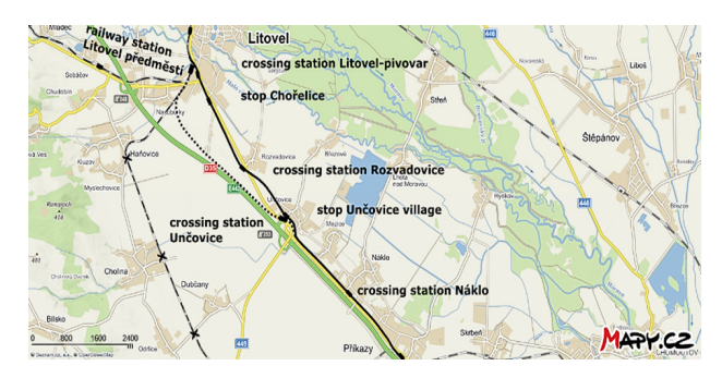
Figure 3. A map of the 2 alternative solutions of the newlybuilt section Unčovice – Litovel, the chosen tram alternative marked bold, the railway alternative is dotted

the rather less populated areas along the line, it is suggested for closure. As an effective and more direct replacement a new line along the highway D35 with direct and frequent service for all the growing villages between Příkazy and Litovel (Náklo, Unčovice, and Rozvadovice) and the town of Litovel itself. Because of the limited space by the highway exit near Unčovice, 2 alternatives were evaluated. The 1st one comprises a new railway line between Unčovice and Litovel, the 2nd one takes advantage of the sharper curve and goes right through the village and with further stops in Rozvadovice and 2 times on the outskirts of Litovel. As there is the need to place the line in the relatively narrow streets, the entire section is here proposed as a suburban tram line with a maximum speed of 80 km/h. Both alternatives are displayed in Figure 3.